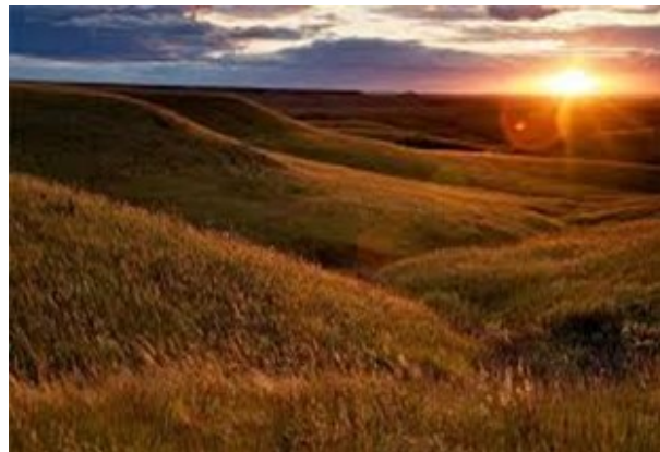
The Flint Hills