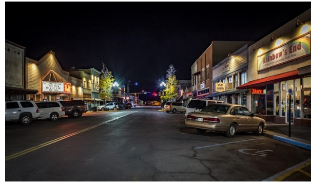
Monte Vista, CO

For someone who wants to be part of the San Juan Basin art and culture scene, Santa Fe and Taos may just be too expensive for a gallery, work studio and home. But in communities like Monte Vista availability of historic brick buildings in downtown offers both significantly lower costs and access to this region's art environment and markets. Many years ago, we did a major study of the San Juan Basin in Colorado and visited Monte Vista with its declining main street. During our last visit to Monte Vista, we experienced a thriving and beautifully renewing downtown in large part to the arts and culture ventures taking advantage of Monte Vista's historic buildings and lower costs.